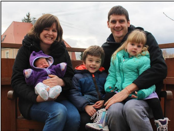
What we wish our life was always like.

donations payable to: TeachBeyond PO Box 610 Downers Grove, IL 60515-0610 www.teachbeyond.org Account #40227