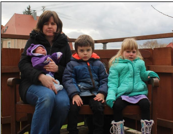
Unfortunately, the reality is often different! :-)

serving God, young people, and the missionary community in Tirana, Albania at GDQ International Christian School www.gdqschool.org