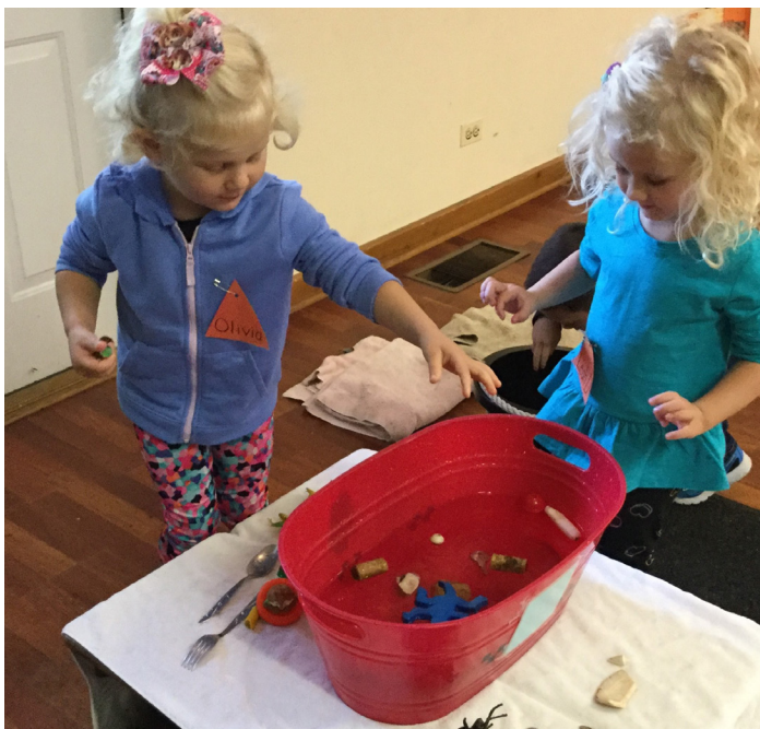
Will it sink or float?