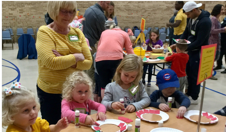
Apple Wreath Craft