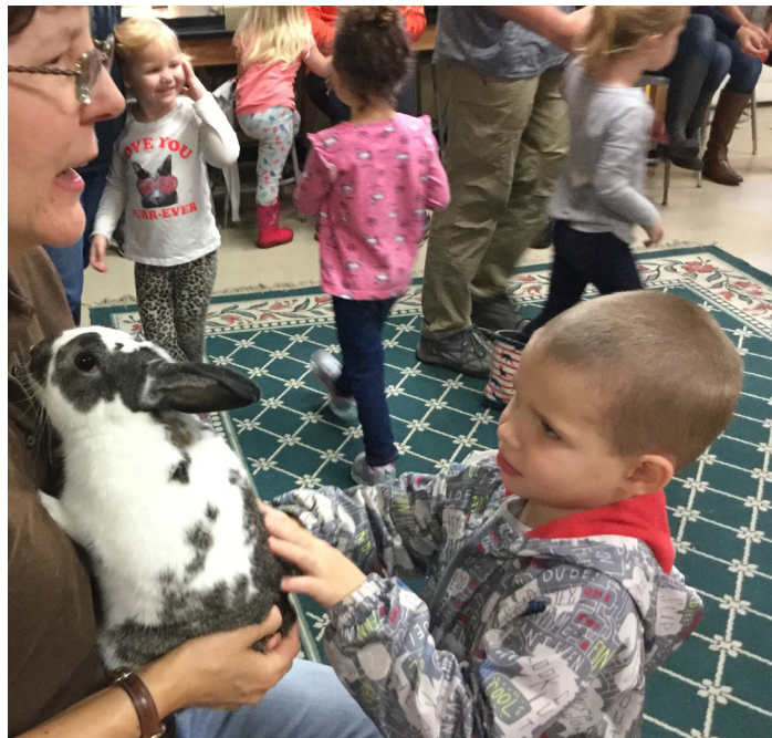
Petting the rabbit was a highlight of the day!