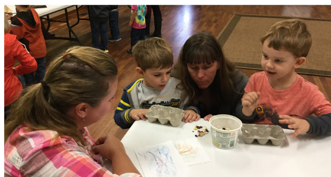
Sorting seeds at Lake Katherine Nature Center.