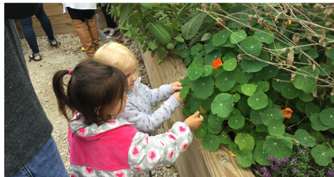
Exploring the herb garden at Lake Katherine Nature Center.