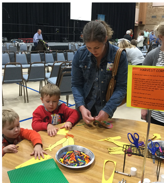
Making a harvest corn craft at our Fall Family Fest.