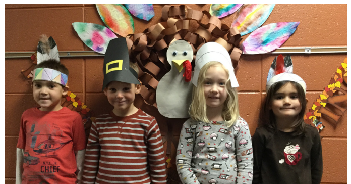
Preschool children learned about Pilgrims, Native Americans, and turkeys in November.