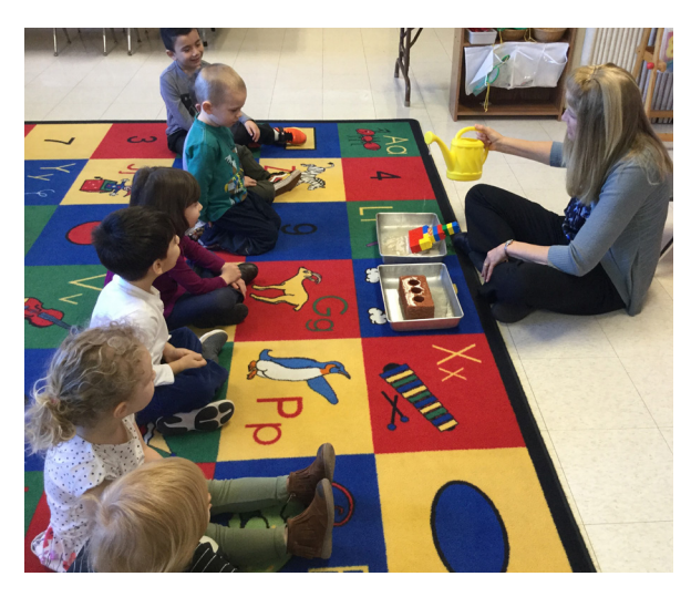
Fun visuals for the parable "The Wise Man and the Foolish Man."