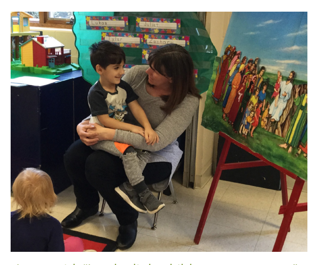
Jesus said, "Let the little children come to me."