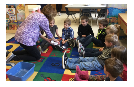
Jesus showed His love for His disciples when He washed their feet.

It is our sincere prayer that the seeds of God's Word are being planted in the hearts of the young children that we teach and that the message of God's love is being shared with the families of the children. One tool we use to share our Bible time with parents and grandparents is our private Facebook page. Each week we post photos and descriptions of our Bible stories as they are being told.