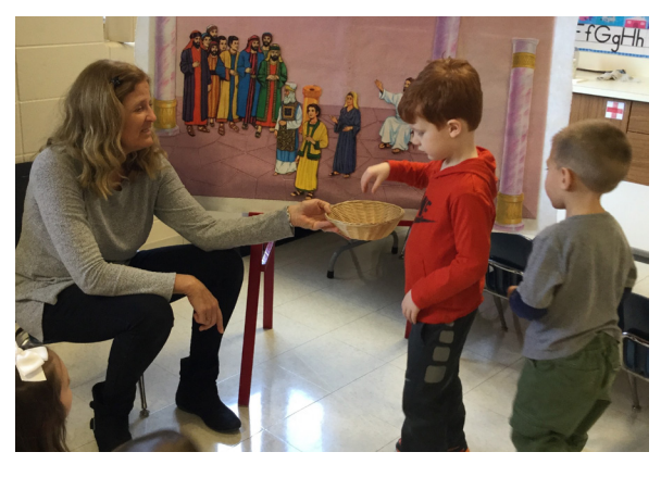
Giving like the poor widow who gave of two small coins