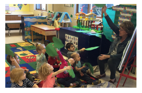
Waving palm branches and shouting, "Hosanna! Blessed is the King!"