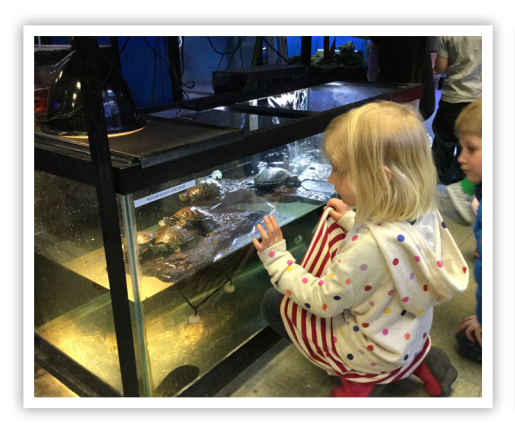
Watching the turtles at the pet shop.