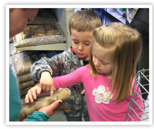
Petting a ferret at Animal Island Pet Shop.