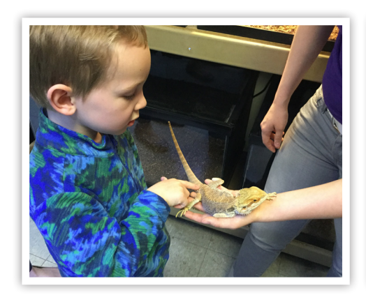
The bearded dragon's skin felt bumpy!