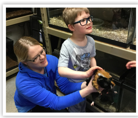
The Guinea pig felt so soft!