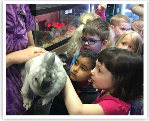
The rabbit was one of our favorite animals at the pet shop!

stories, and even now are busy counting down 21 days until our baby chicks hatch. We can't wait to meet them, pet them, and watch them grow when they hatch during the first week of May.