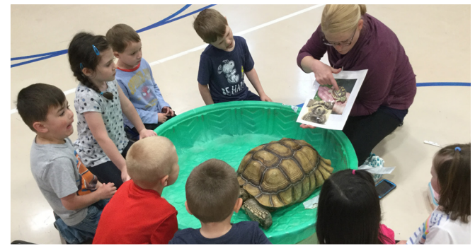
“Congo” the tortoise grew from the size of an adult hand to a 100 pound pet!

We enjoyed learning some interesting facts about Congo. He is able to be outside when the temperatures are warmer than 60 degrees. He mostly sees the color red, and his favorite food is watermelon. Congo also loves to eat green vegetables, and the family garden needs to be protected from him! We thank Beth and Connor for being willing to bring Congo to school and share him with us. What a special treat!