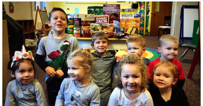
Preschool children with the donations for the Orland CRC Food Pantry.