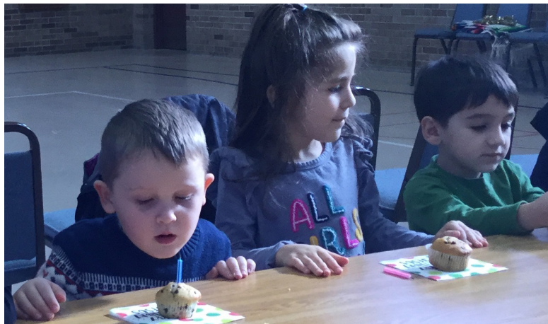
"Happy Birthday dear Jesus, happy birthday to you!"

It is our prayer that each child's heart is opened to the love of Jesus as they learn at Orland Park Christian Preschool. It is encouraging to speak with parents of former preschoolers who tell us that even after their children have grown and moved on to other schools, the Christmas lessons they learned in preschool have stayed with them. We are grateful to God for the work of His Spirit in the lives of our children.