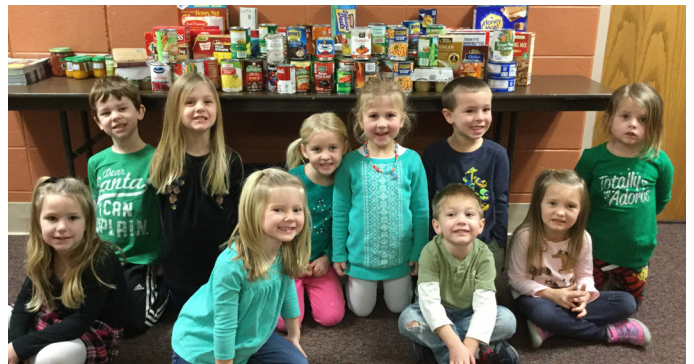
Preschool children with the donations for the Orland CRC Food Pantry.