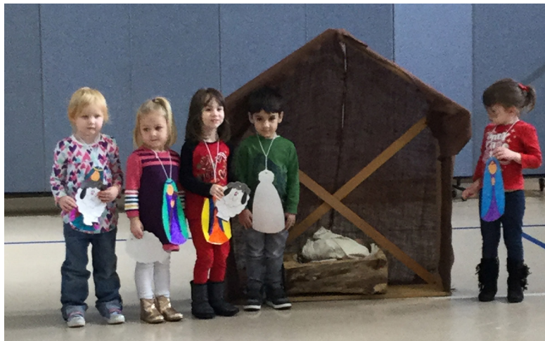
The shepherds came to see Baby Jesus.

Thank you so much to our church's pastors, council, preschool board members, and congregation for supporting us with your gifts and prayers so that we have the opportunity to share the important message of God's love at Christmas and always!